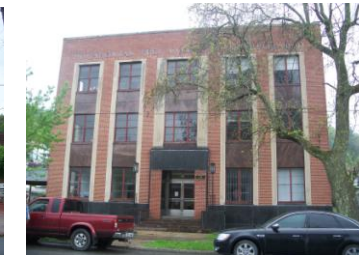
Pocahontas Fuel Company Building