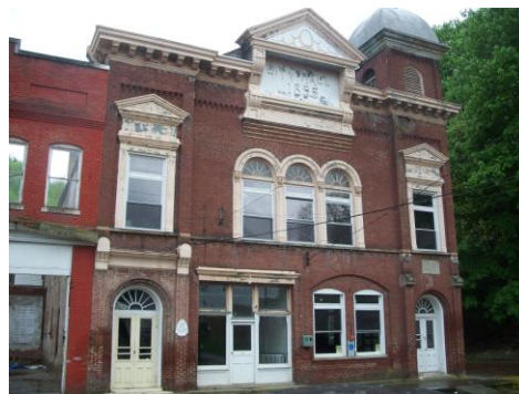
Opera House & City Hall

A downtown driving tour was also suggested using 1920's vintage cars and horse-drawn carriages. The passing of a law to allow golf carts on city streets opens the opportunity to offer this mode of transportation as well. A wagon ride was also suggested as it was noted that Pocahontas once had a number of stables.