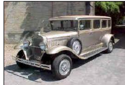
Vintage Car Driving Tour is recommended

The proposed passenger train connecting Pocahontas to Bramwell was addressed as well as some alternative transportation opportunities such as a trolley to connect the two towns together until the railroad track is replaced and the route reopened.